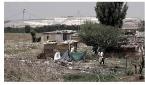
An award winning artist, based in Milan, who shows in her photos, a strong connection between people and a changing environment

Photographers that have managed to tell a story just with one picture, sending a message instantly.