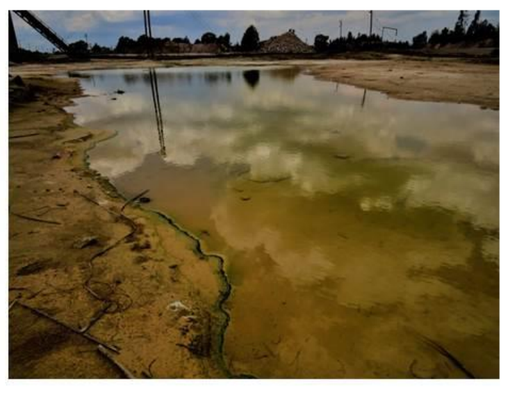
The high level of copper in the water can be seen as a green residue around the edges of this puddle in a tailing.

As the photographs show they are layered with the sediments of the heavy metals.