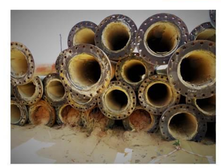
Pipes that carry the harmful water from the mines and tailings to dam sites are littered around the lands.

As the photographs show they are layered with the sediments of the heavy metals.