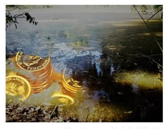
All my photos were edited in the GIMP platform to create the effects seen here.

Here, the learner has acknowledged the technical influence of another artist. The learner has used the process of digital manipulation to create images which combine ideas and develop the theme. The learner makes use of design theories of harmony, order and balance — in reverse, to create contrasts. The learner presents images of pipes, a dam and coins in a disorderly relationship. The learner seeks to visually represent an imbalance within a sustainable environment.