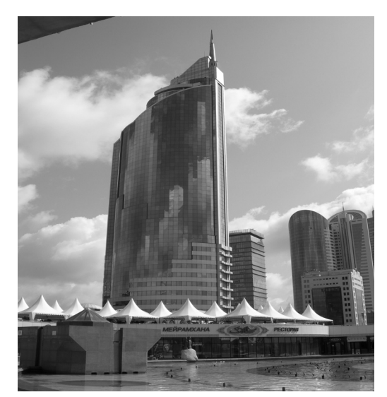
Astana, the capital of Kazakhstan

As more and more people move to cities there are many challenges for authorities and governments. Rapid growth of cities often creates problems for people. Life is more expensive in cities. Many people arrive in cities before resources and facilities are available. This causes many problems and creates slum areas and shanty towns.