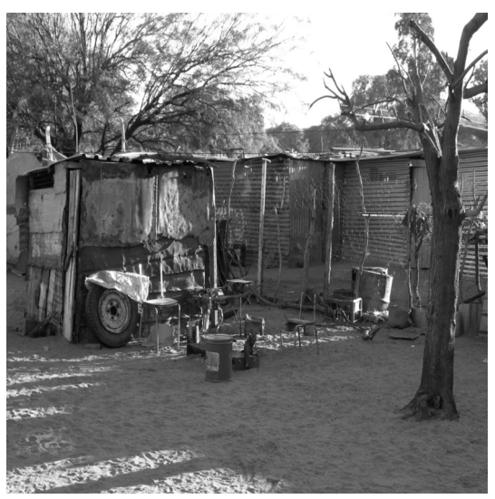
A slum area in Namibia