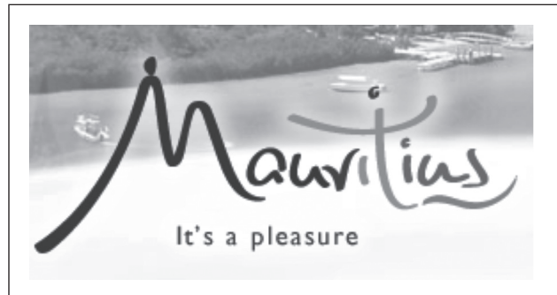
Fig. 2 for Question 2

Mauritius is internationally renowned as one of the world's premier luxury holiday destinations. With many of the world's most famous hotels, which have won many tourism awards, Mauritius enjoys one of the highest rates of returning visitors in the world. This is because of the friendliness and professionalism of the service visitors receive. Mauritius is an island destination of striking natural beauty and cultural diversity. Combined with a mild tropical climate, the friendliness of the Mauritian people and high levels of safety and security, this has made Mauritius one of the world's most appealing tourism destinations.