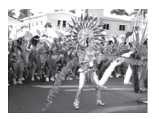
Fig. 2 for Question 2