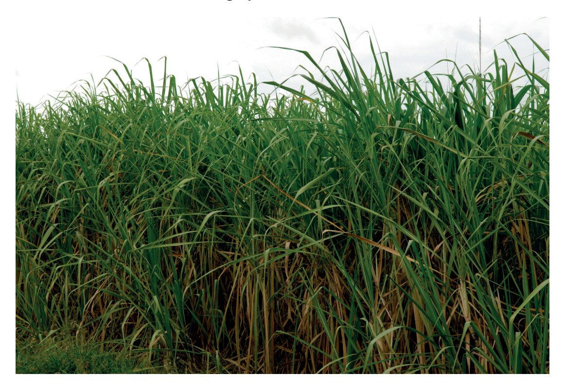
Photograph D for Question 3