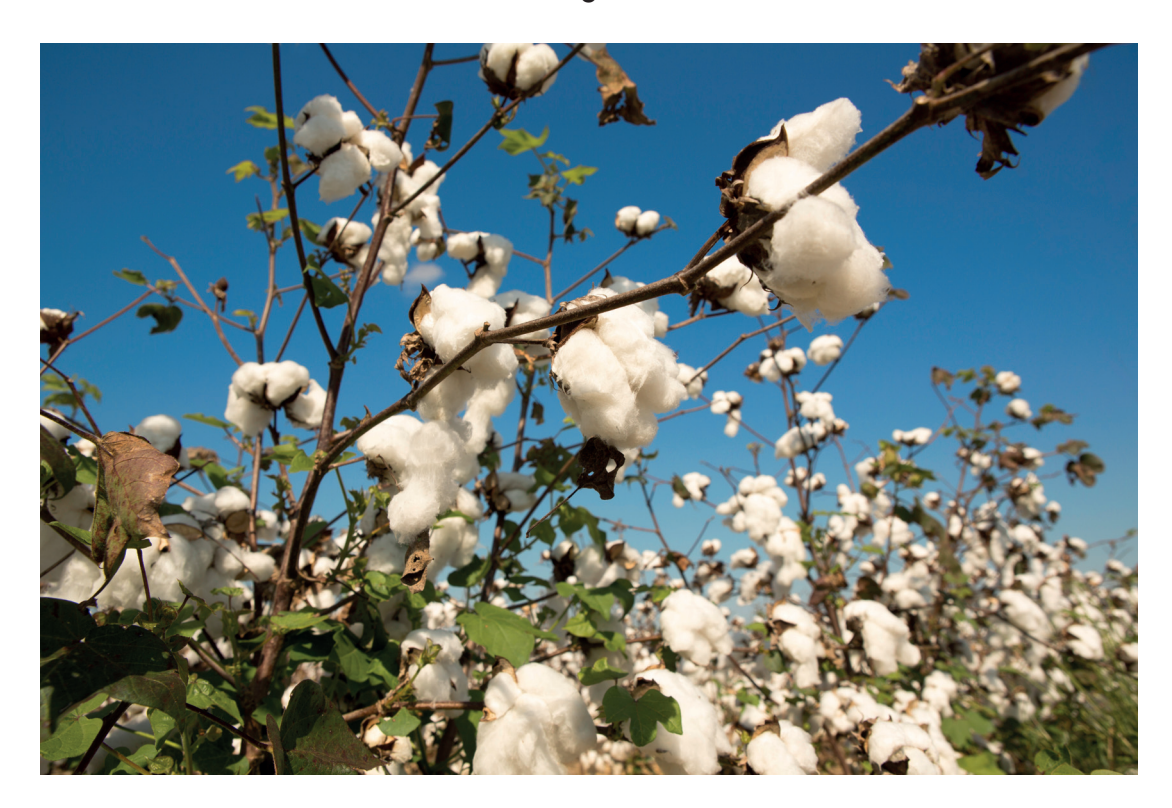
Photograph C for Question 3