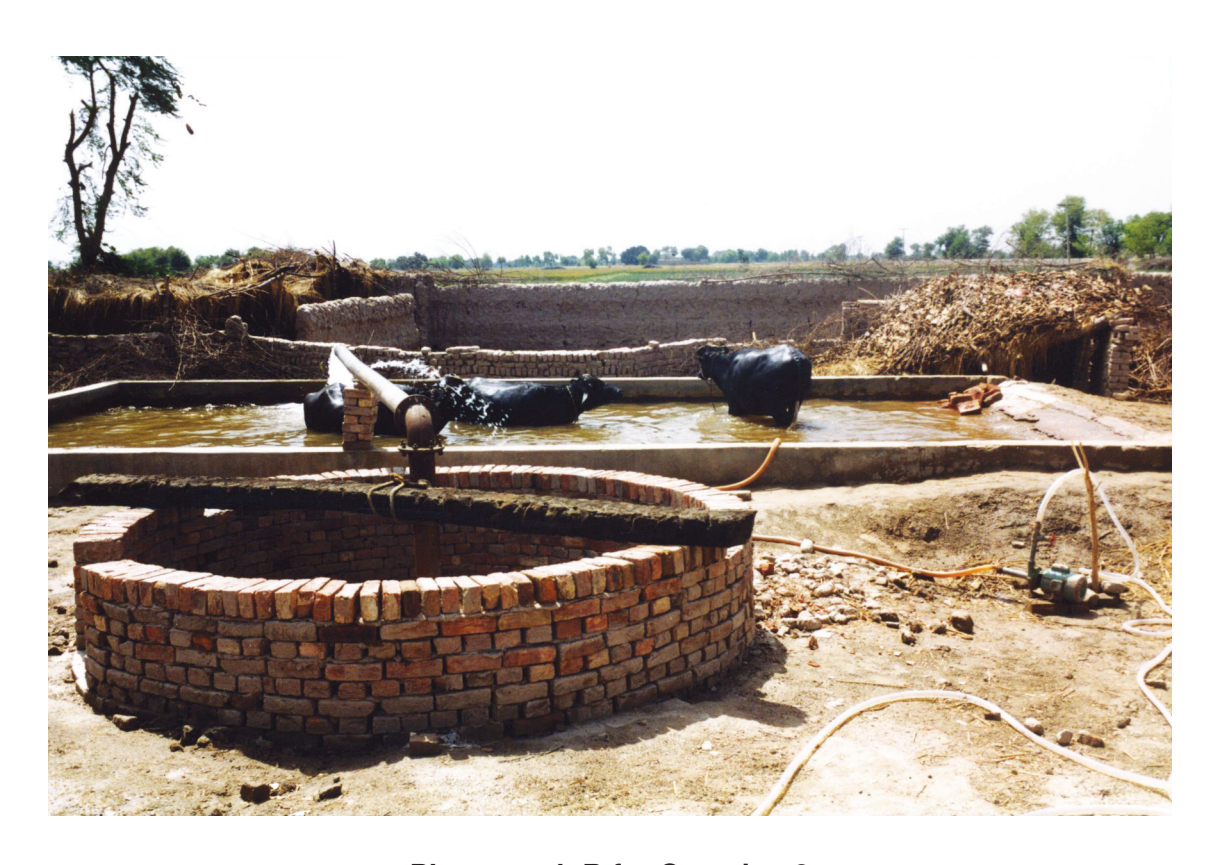
Photograph B for Question 2