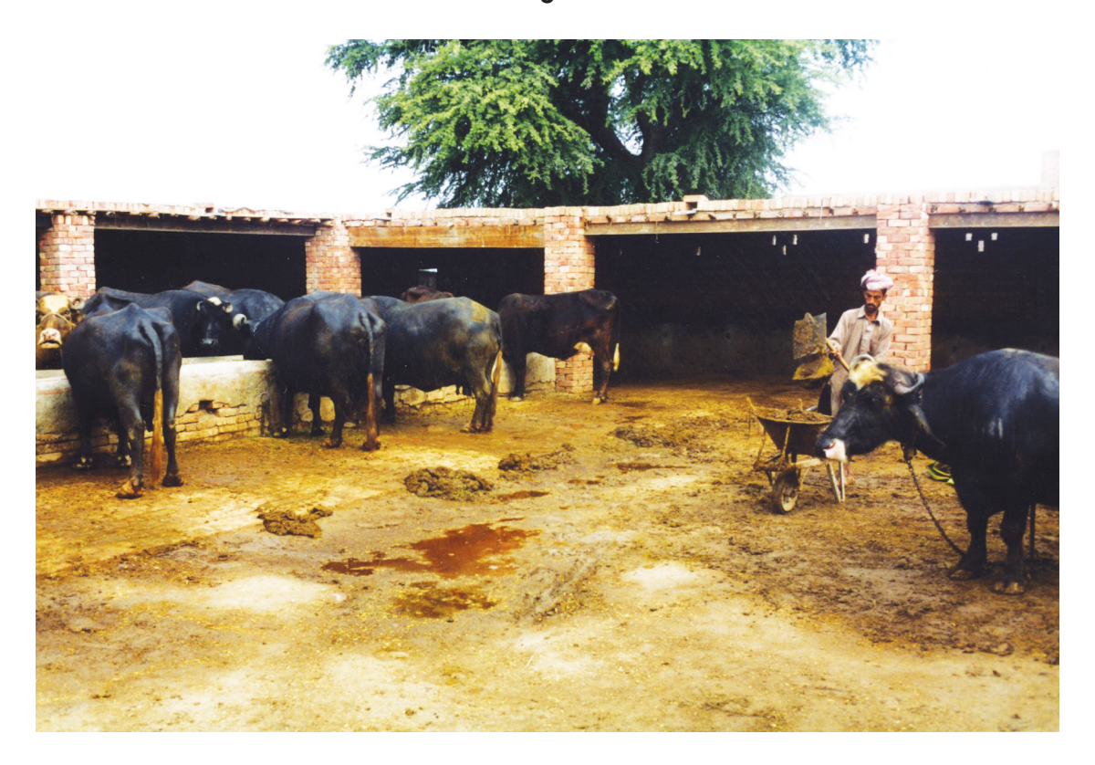
Photograph A for Question 2