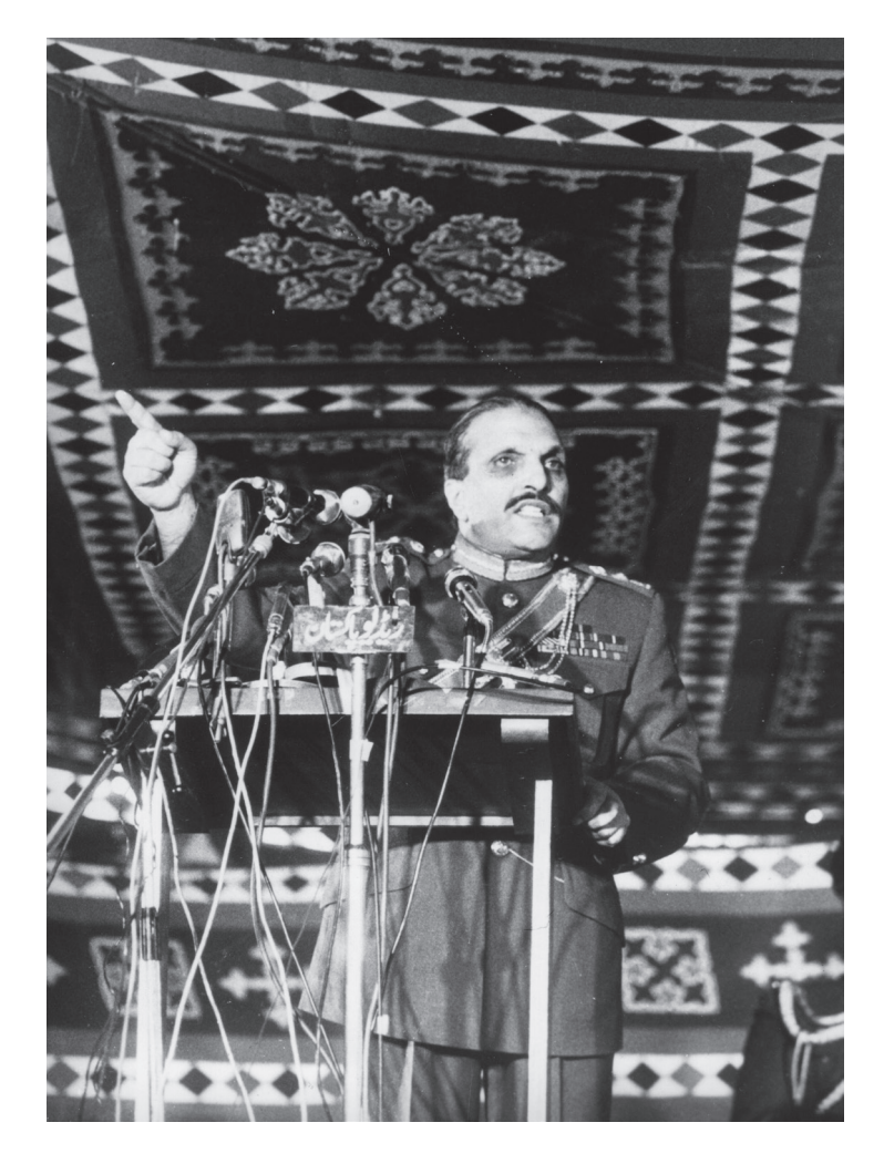
A photograph of Muhammad Zia-ul-Haq, President of Pakistan 1978–1988

Permission to reproduce items where third-party owned material protected by copyright is included has been sought and cleared where possible. Every reasonable effort has been made by the publisher (UCLES) to trace copyright holders, but if any items requiring clearance have unwittingly been included, the publisher will be pleased to make amends at the earliest possible opportunity.