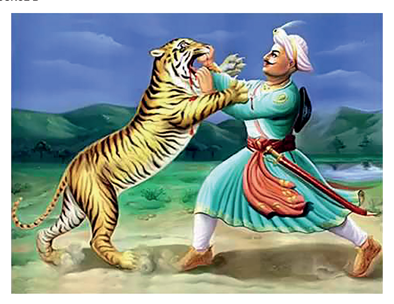
An image portraying a legend about Tipu Sultan, ruler of Mysore (artist unknown)

Permission to reproduce items where third-party owned material protected by copyright is included has been sought and cleared where possible. Every reasonable effort has been made by the publisher (UCLES) to trace copyright holders, but if any items requiring clearance have unwittingly been included, the publisher will be pleased to make amends at the earliest possible opportunity.